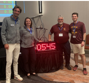
Recent IST Clock Raffle Winners

Don’t forget your hotel reservation for special clinic rate