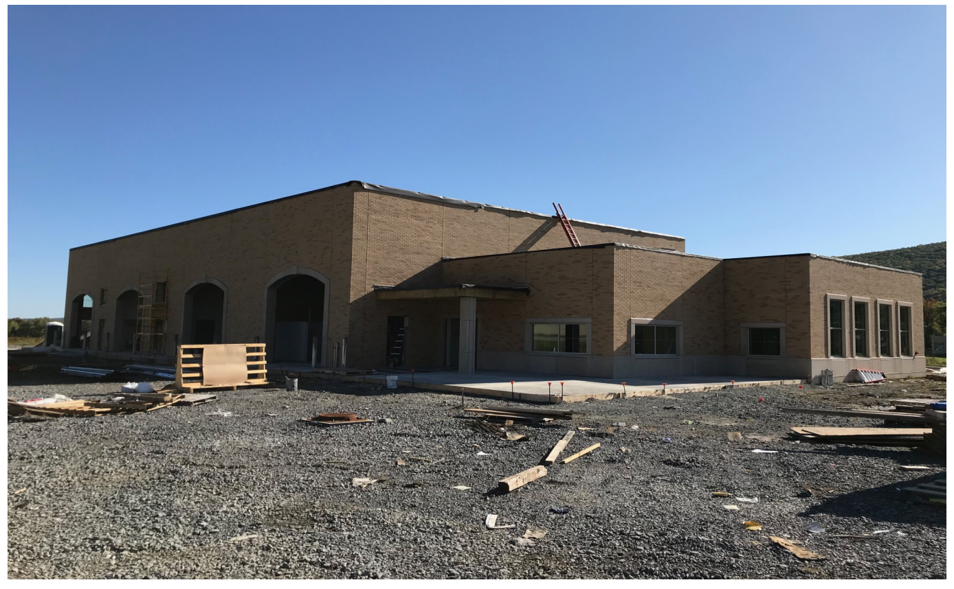
Casework and Ceilings at New Bus Garage